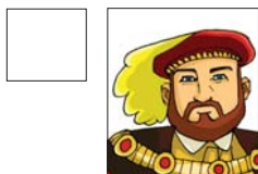
King Henry VIII