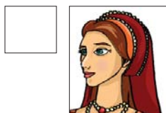
Lady Anne Boleyn